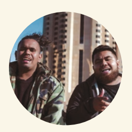
DEM MOB <sup>1</sup> Hip hop